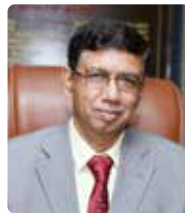
Shri. Amit Banerjee Cmd, Beml