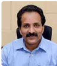
Shri. S. Somanath Chairman ISRO & Secretary DOS